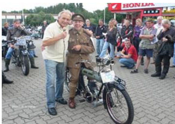
Former Speedway Worldchampion Egon Müller with Ralph Boreham "Baby Triumph" 1915

The "DK's" mark the check points and are indicated by clear YELLOW/BLUE SIGNS on the right side of the lane, the participants will get their control cards marked in the designated spaces in the pre-printed order 1st-2nd-3rd etc. by a control post.