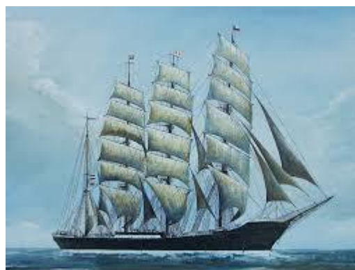
historic vessel "Peking" at Hamburg dockyard