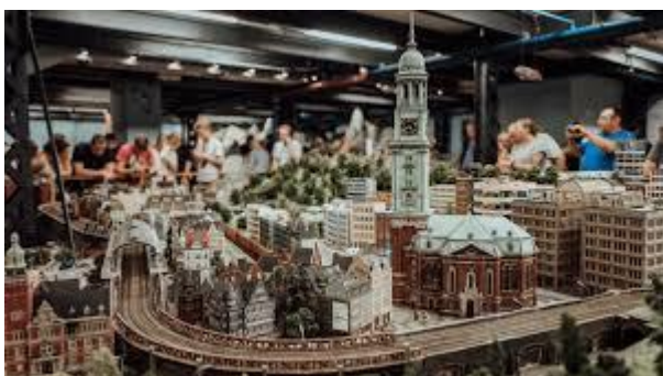
Miniatur World Hamburg

Sightseeing boat trip on the Kiel Canal with visit of the Brunsbüttel locks or a trip to Hamburg with a visit to the Miniatur Model World and the Museum sailing ship "Peking" in the Hamburg harbour museum including a harbour tour. If you are interested, please tick on the entry form. We will organize something for a minimum of 20 people